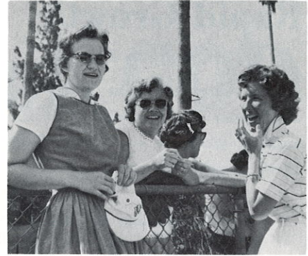
Visiting with friends was a favorite pastime.

hunting for lost socks and shoes and nursing sore muscles and sunburned shoulders.