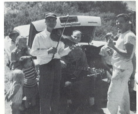
Music in the mountains.

All too soon it was time to head for home. Reluctantly we began to break camp and stow our gear back into our cars. Everyone was tired but happy because we had enjoyed this opportunity for Christian fellowship and recreation.