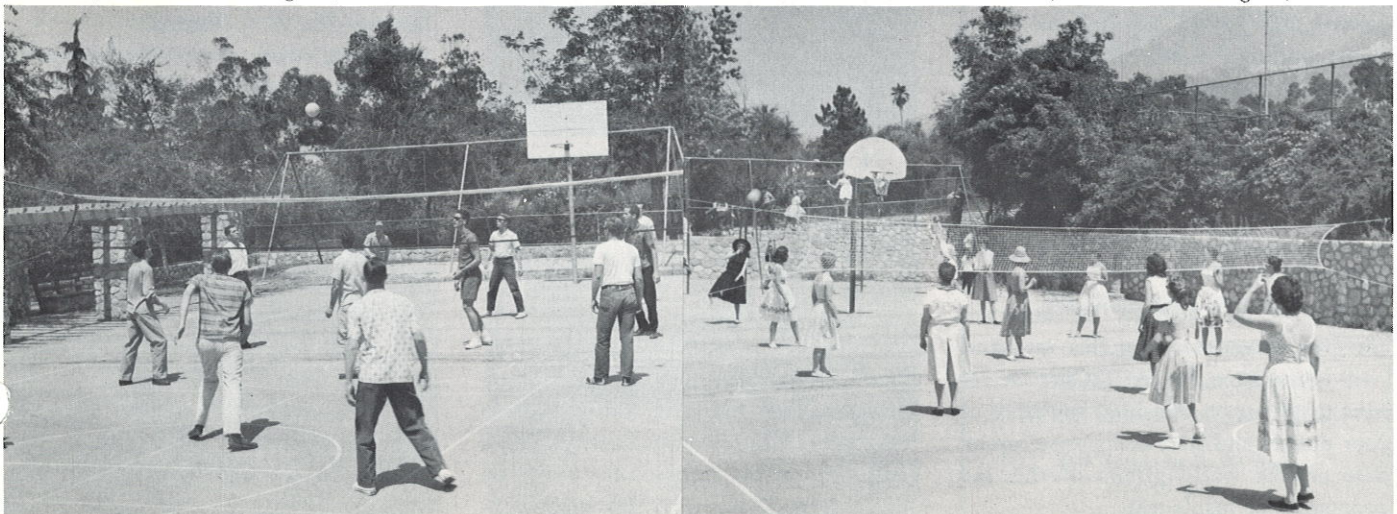
Both the men and the women enjoyed vigorous volleyball at the second Pasadena Church Picnic.