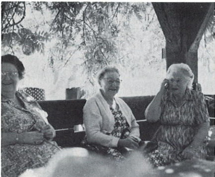
Some folks just like to sit in the shade.

By two p.m. when that much-sought-after food was served, everyone had participated in the game or walk of their choice . . . chess to Chinese