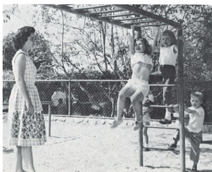
Picnics are a child's delight.