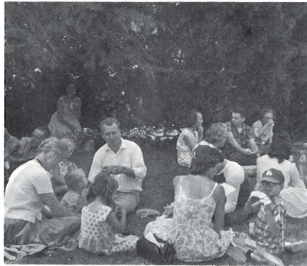
A leisure lunch satisfied everyone.

Back at the picnic, the official day was topped off with cold watermelon at 5:00 p.m. Mothers began gathering up their children from the baby-sitters,